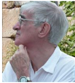
John Dominic Crossan